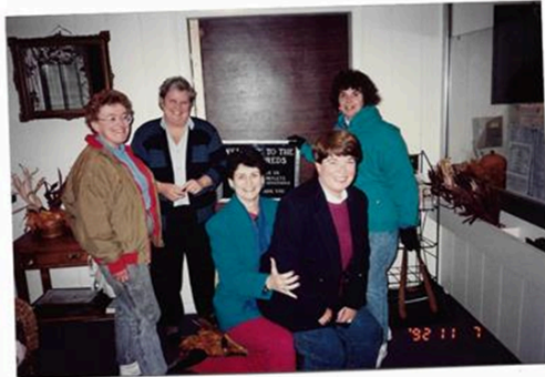
We always had fun. Here we are at the Cape 11-07-1992